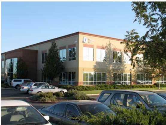
202 Cousteau Pl, View at Cousteau & 2 nd St